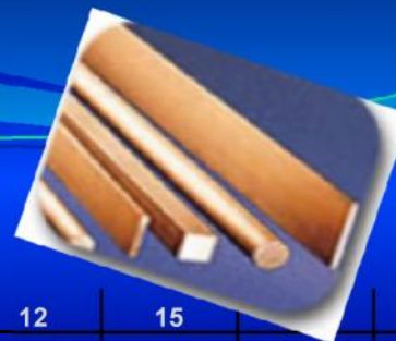
TABLA DE PESO POR METRO LINEAL